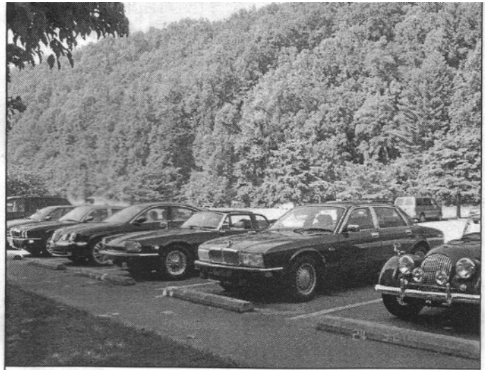
The Jaguars and Morgan are poised and waiting to take on the "Dragon"