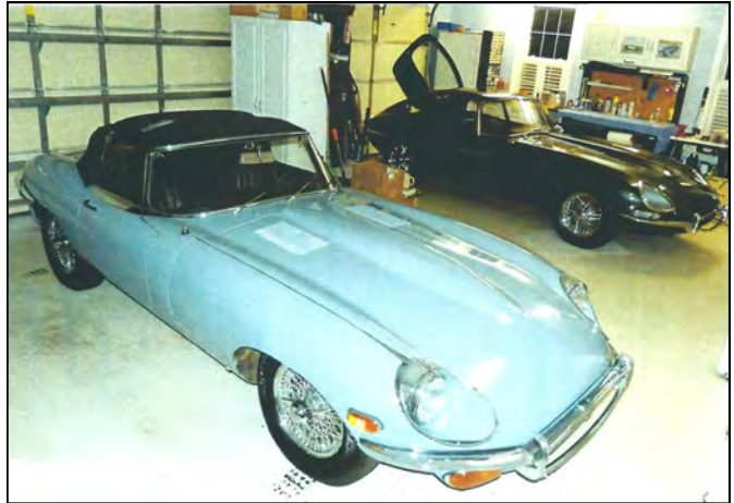
Cats resting in Bill's garage the night before the show .

Here in New Bern, NC. The local car club sponsored a car show with 165 cars of all types. Living 3 hours away, Mike brought his Jaguar here and we both showed our E-Types. We were parked beside each other and got a lot of attention. One does not see many XKE's in a muscle car rich area.