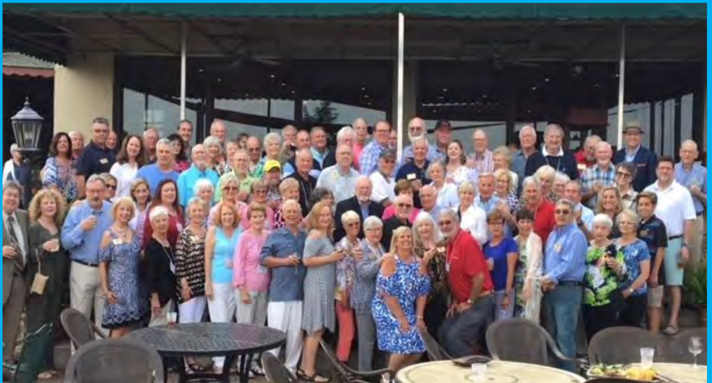
2018 CJC Concours at Switzerland Inn, Group Photo