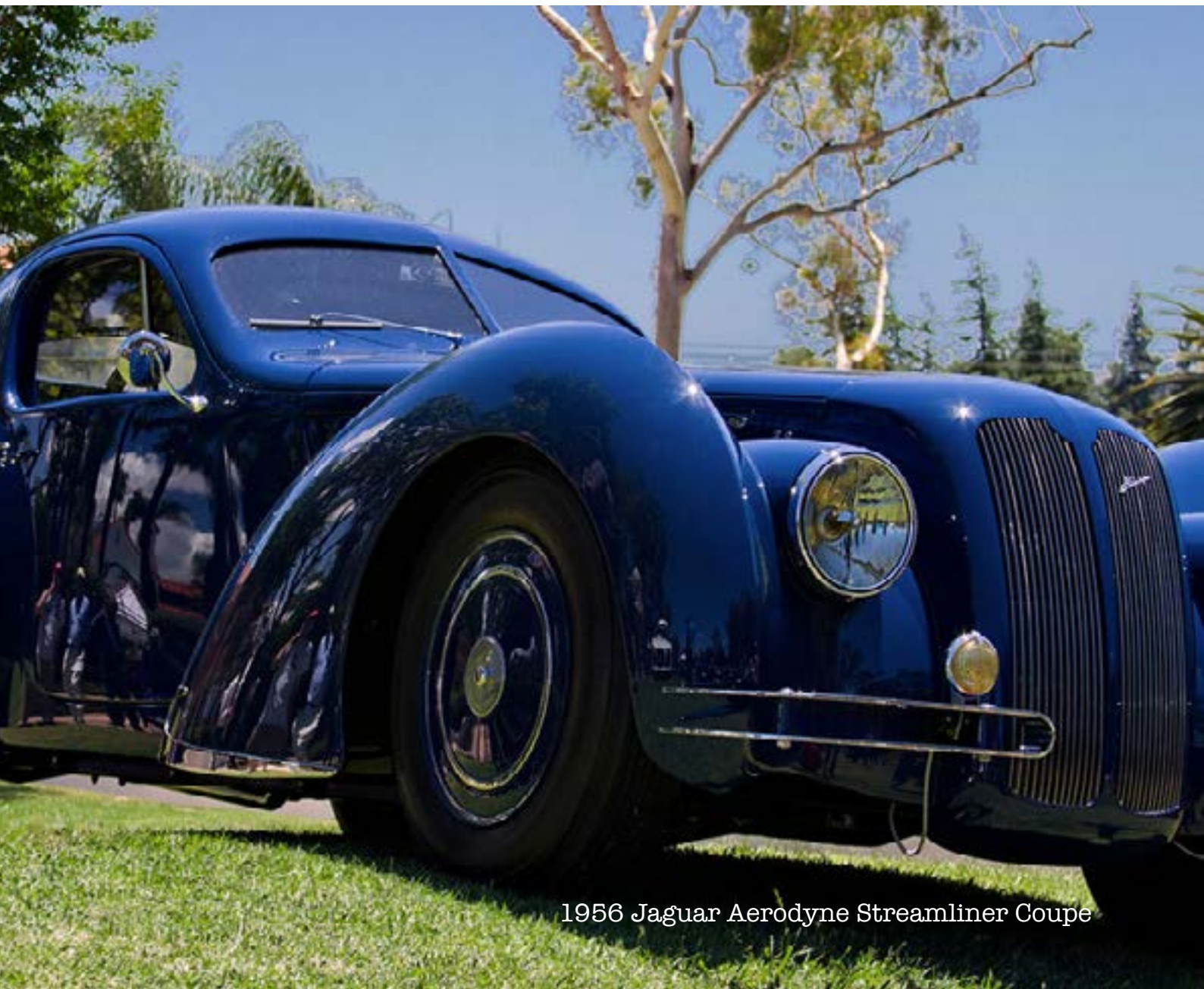
1956 Jaguar Aerodyne Streamliner Coupe