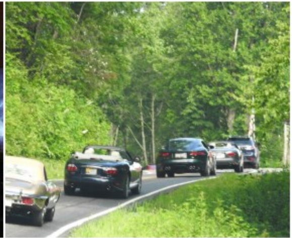
Heading out on the Friday road Rally